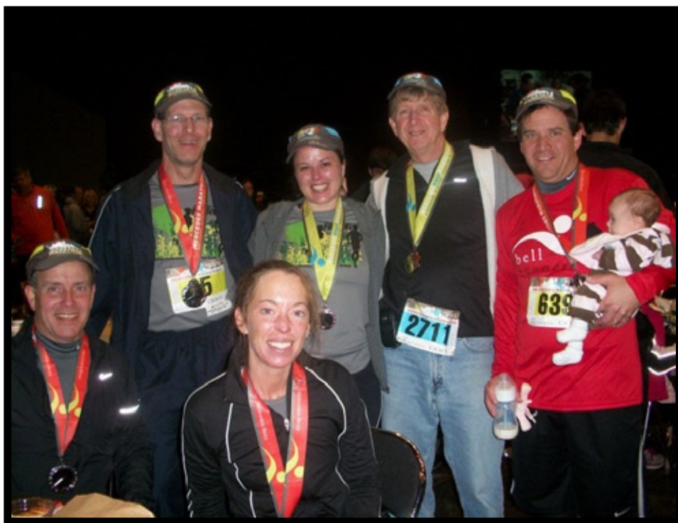
Members of the HERG after completing the MERCEDES MARATHON.

Thus, began the Saturday morning tradition of HERG.