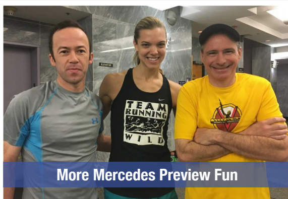
More Mercedes Preview Fun