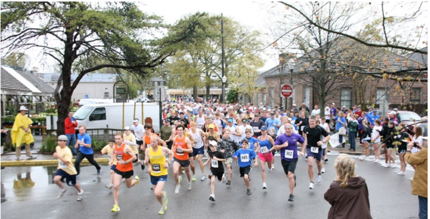
Runners hit the pavement for the start of the inaugural RUMPSHAKER 5K in Crestline Village.