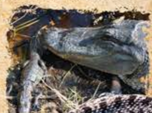
OUR RESIDENT ALLIGATOR, LEFTY