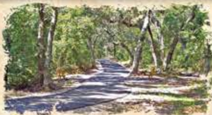
GULF OAK RIDGE TRAIL