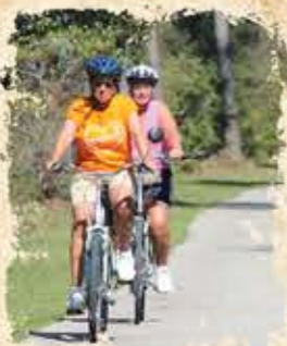
BIKERS ON THE TRAIL

or work on Watchable Wildlife projects. Please call 251.981.1180 for more information.