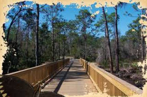
TWIN BRIDGES TRAIL

those who want to linger a while and a butterfly garden and pavilion are the perfect spot for a picnic. Whether you're looking for a quick escape or a day-long adventure, the Backcountry Trail offers a unique opportunity to explore the natural beauty and diverse landscapes of Alabama's Gulf Coast.